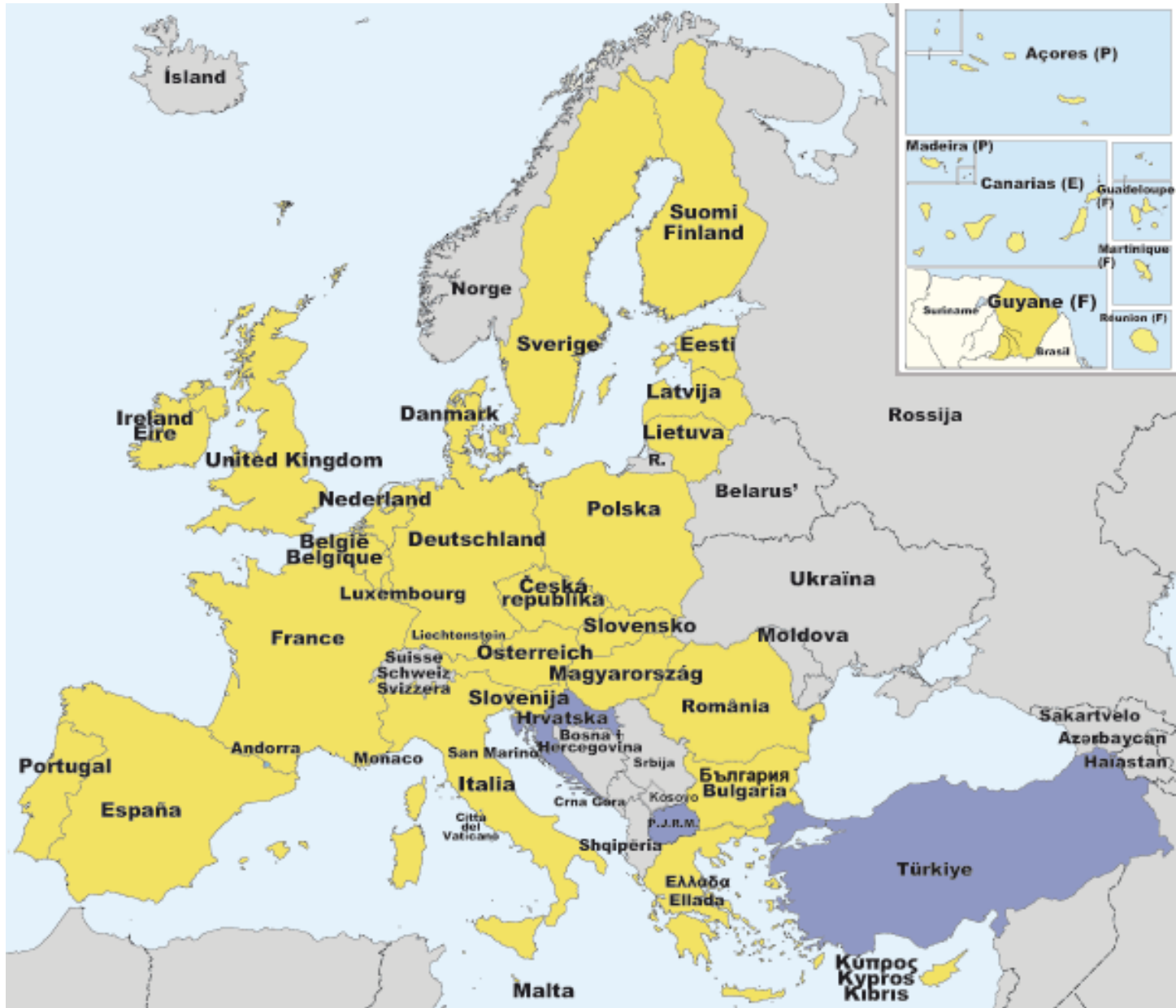
EU member states